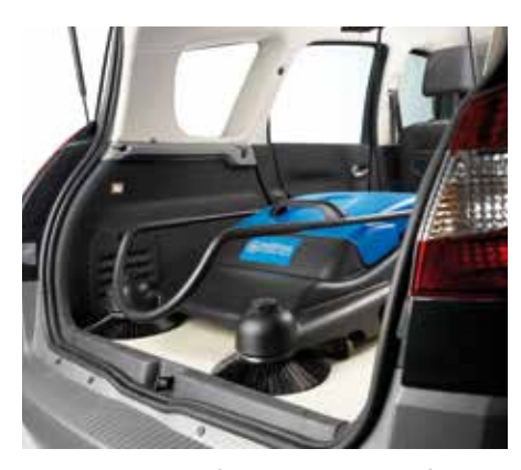
The handle can be folded without tools for storage and easy transportation.