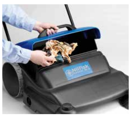
The hopper can stay in open position so it is easy to throw big items or empty a garbage bin into the hopper.