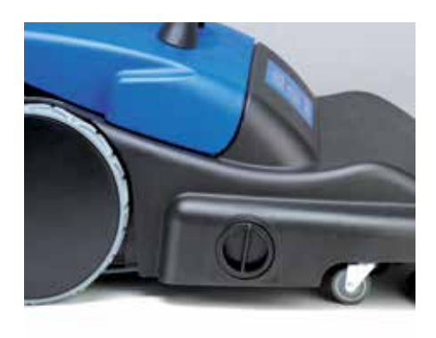
The main broom can be adjusted in 4 different positions without the use of tools.