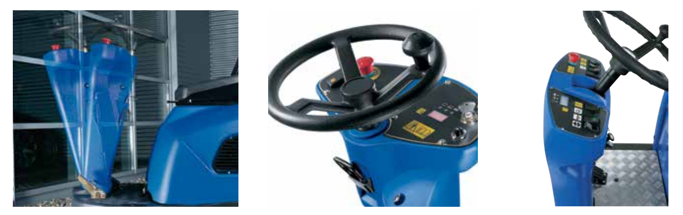
The steering column adjusts to fit the operator and to ensure easy access to the machine.