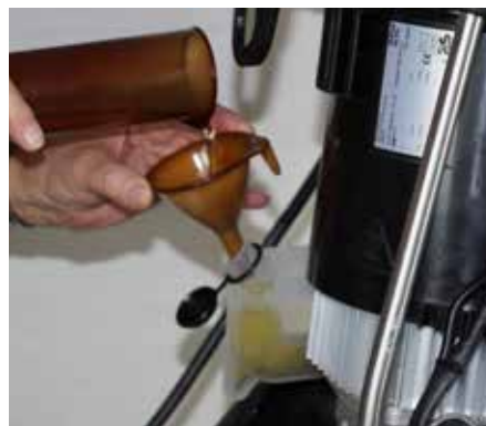
Pump oil tank with oil level sight and fill/empty function.

Some machines in the MC 3C range include this FoamSprayer technology, which allows a simple and efficient application of detergent. If not included it can be bought as an optional accessory.