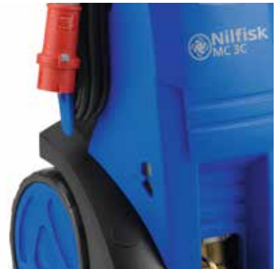
The turnable cable hook makes winding and unwinding of the electrical cable child's play.