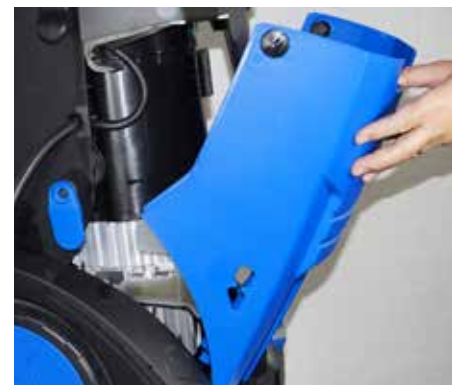
Cabinet can be removed quickly for direct access to the motor pump.