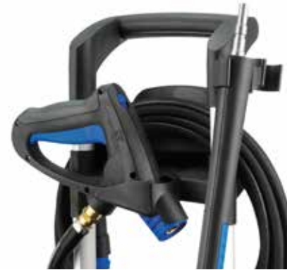
Unique patented Spray Gun Holder protects the gun from falling on the ground and being dragged behind the machine – preventing damage.

MC 3C is designed for light, general cleaning tasks and is the ideal choice for tradesmen, small building companies, small garages and farms.