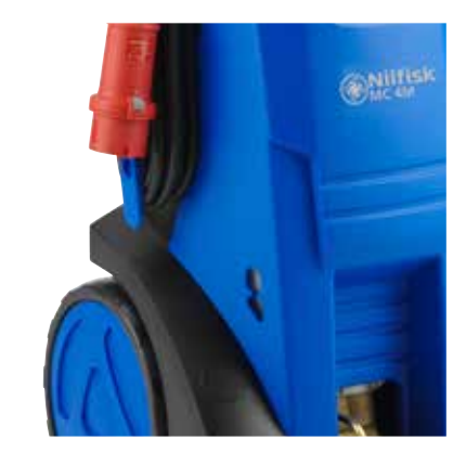
The turnable cable hook makes winding and unwinding of the lelectrical cable child's play.