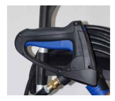
Unique patented Spray Gun Holder protects the gun from falling on the ground and being dragged behind the machine – preventing damage.

Designed for low intensity cleaning applications, the MC 4M is the powerful choice for small and medium agricultural sites, building companies, garages and car rental companies. Also, well suited to meet the needs of public authorities, small cleaning companies due to the limited sound level of the motor pump.