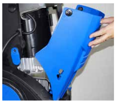
Cabinet can be removed quickly for direct access to the motor pump.