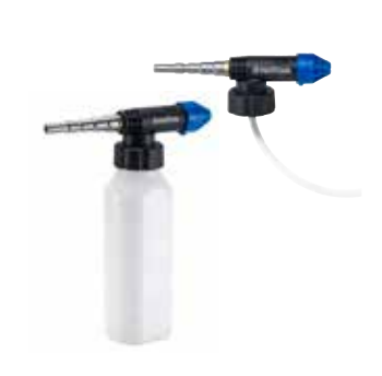
The FoamSprayer technology allows a simple and efficient application of detergent.