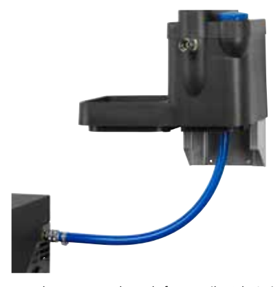
External Water Break Tank for op til 40 ltr/min.