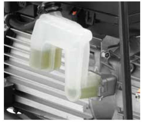
Pump oil tank with oil level sight and fill/empty function