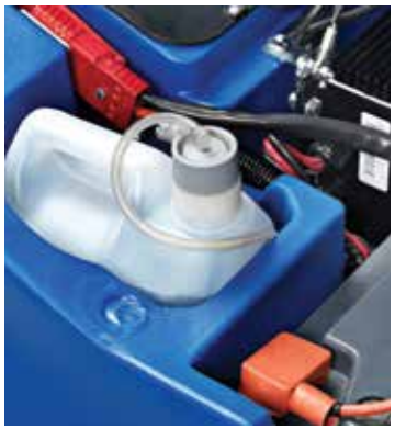
All models are prepared for the optional integrated chemical mixing system.