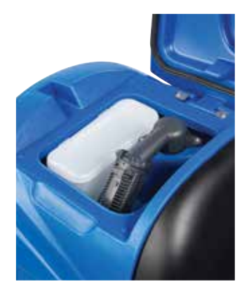
Large recovery tank opening with standard debris tray.