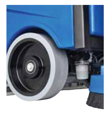
Large non marking/oil resistant wheels and easy to clean solution filter.