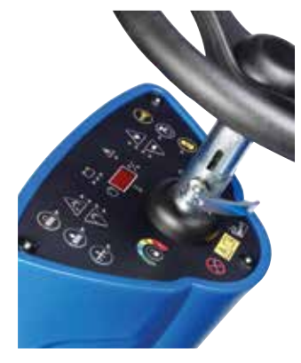
Easy to understand control panel and adjustable steering wheel for optimal ergonomics.