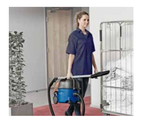
The entire machine, including wand and hose, can be carried safely and comfortable in one hand.

To help with easy maintenance and to maximise safety, an orange detachable power cord is included as standard.