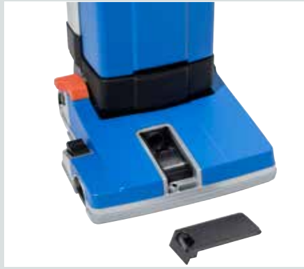
Cleaning hatch for the suction channel. To remove any stuck debris.