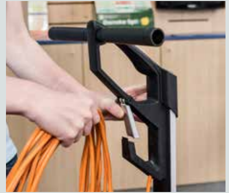
Cord clip for easy storage of the cord.