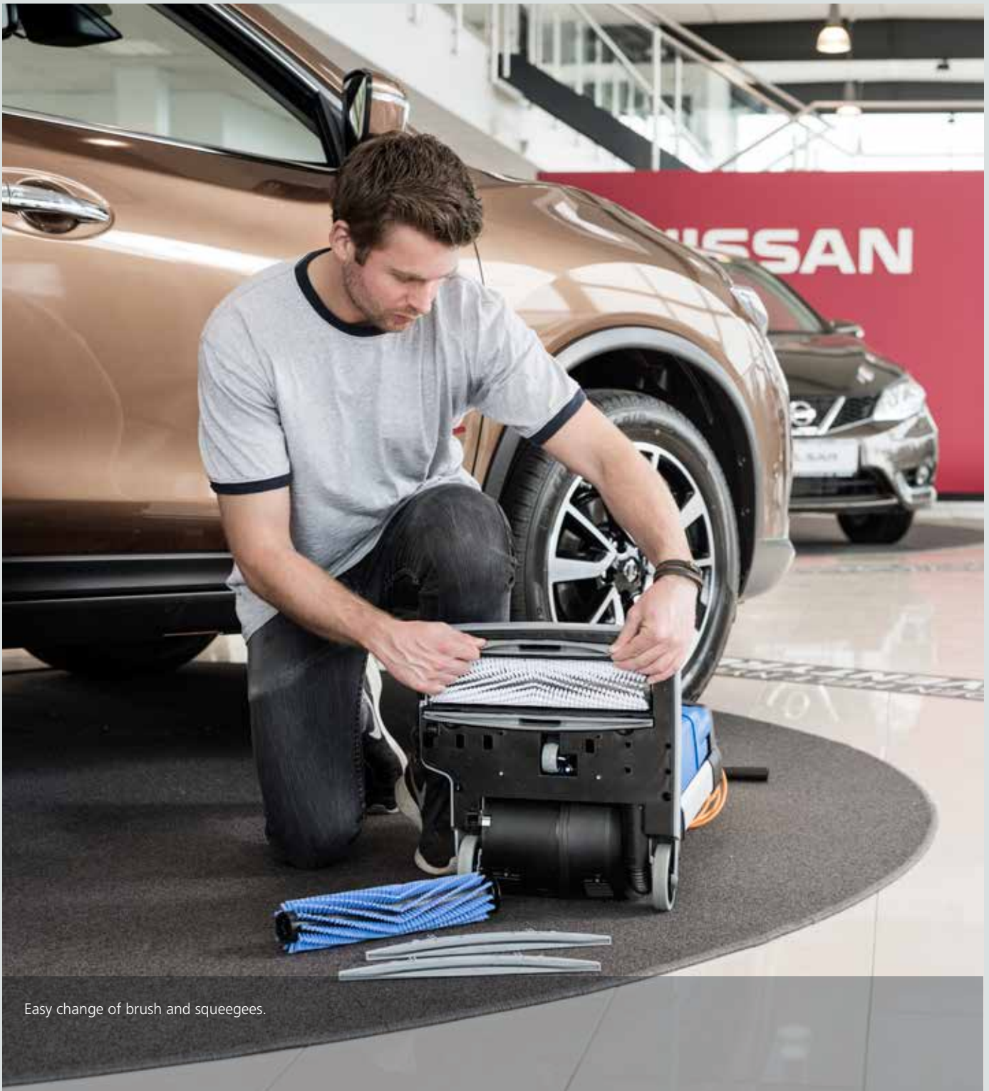
Easy change of brush and squeegees.