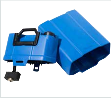
Recovery tank design makes it fast and easy to clean 100% dirt from the tank.